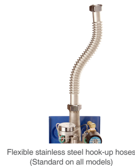
Flexible stainless steel hook-up hoses (Standard on all models)

Upstream Systems are for Potable, Reuse and Rainwater applications and are effective even on surface water from lakes, streams, cisterns and dug wells.