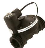
Automatic Shut-off Solenoid Valve (Optional on all models)